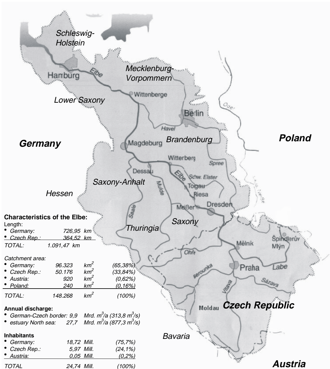
Figure 1: The Elbe Catchment Area [IKSE 1995]